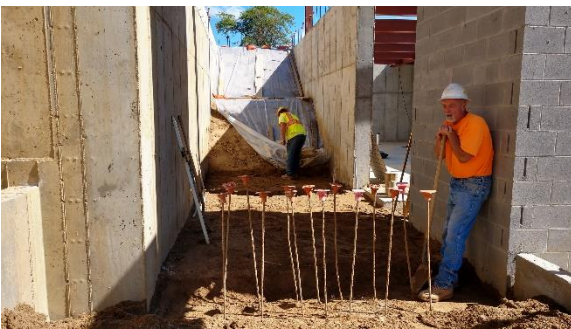
Lower Level Entrance & Stairs Graded