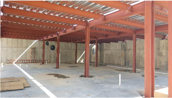
Lower Level Steel