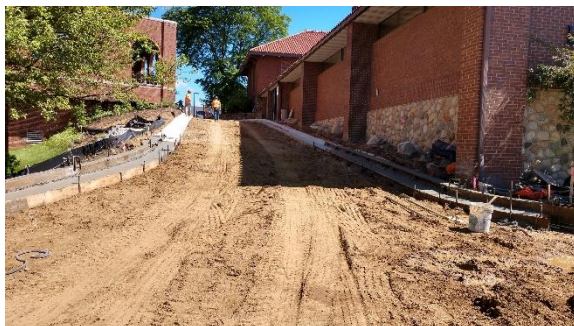
West Drive Looking North