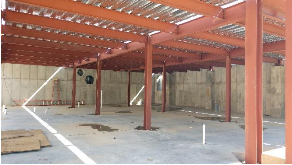
Lower Level Steel