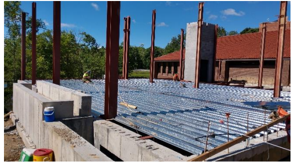
Ground Level Steel & Decking