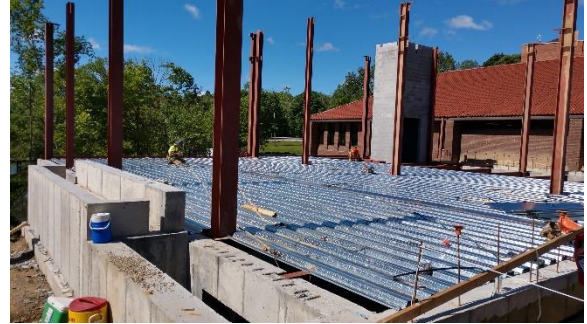
Ground Level Steel & Decking