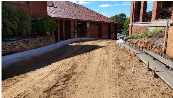
West Drive Looking South