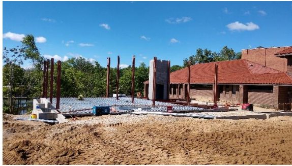
Ground Level Steel Progress

Phase I (House Move & Library Addition) 42% Complete