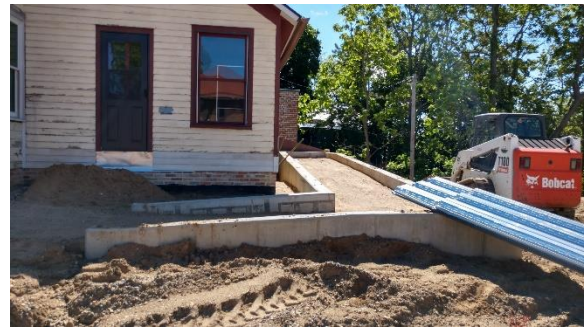
Green's Ramp Foundations