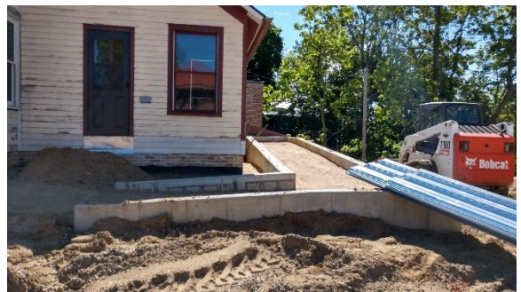
Green's Ramp Foundations