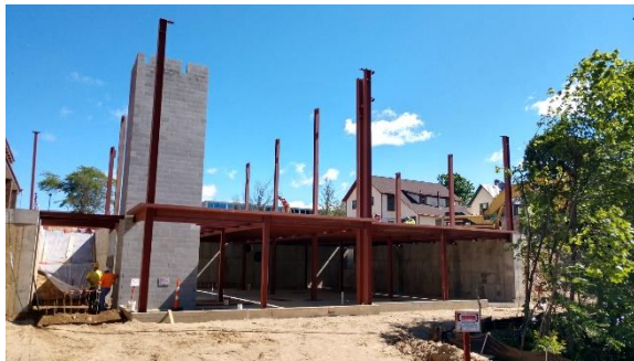
Lower Level Steel Progress from South