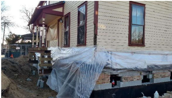
Partial Backfill at Green's