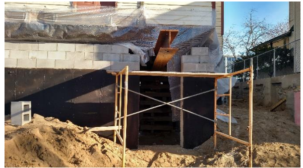
Green's Bilco Door Location