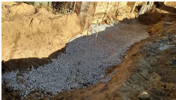
Excavation for Library South Retaining Wall