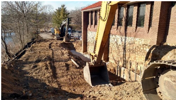
South Retaining Wall Excavation