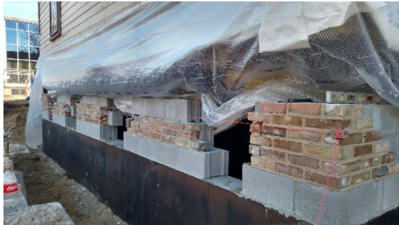
Green's Block and Brick – West Side

Phase I (House Move & Library Addition) 18% Complete