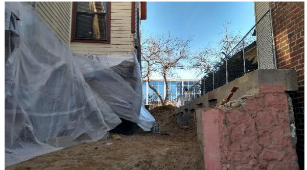
Partial Backfill at Green's