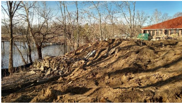
Existing Retaining Wall Cut to Below New Grade