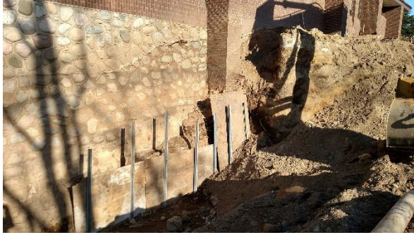
Shoring/Bracing at Library Addition