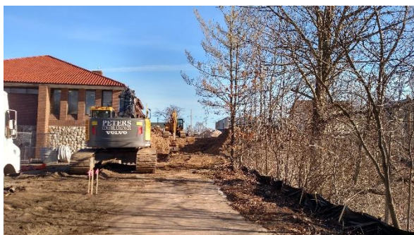
Site View from South