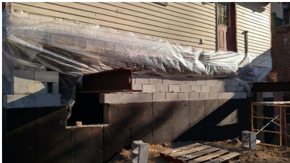
Green's Block – South Side