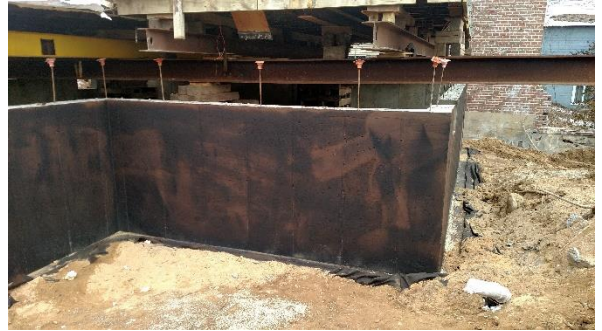
Green's Foundation Waterproofing