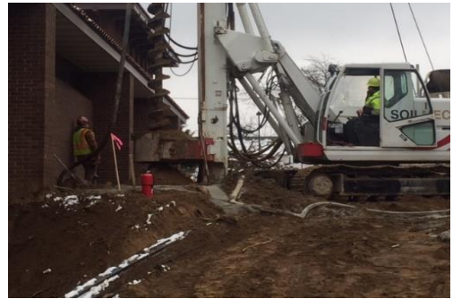
Augercast Shoring Drilling