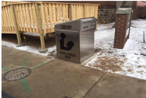
Temporary Book Drop