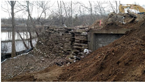
Existing Retaining Wall