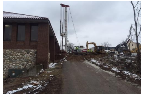
Augercast Shoring Drilling