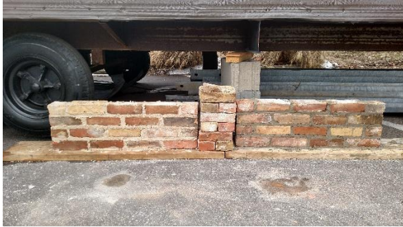
Green's Brick Mock Up