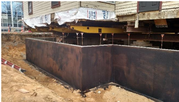
Green's Concrete Foundation & Waterproofing