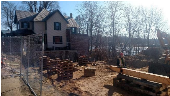
Green's New Location – Ready for Move