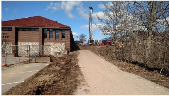
East Drive Guardrails Removed

Phase I (House Move & Library Addition) 12% Complete