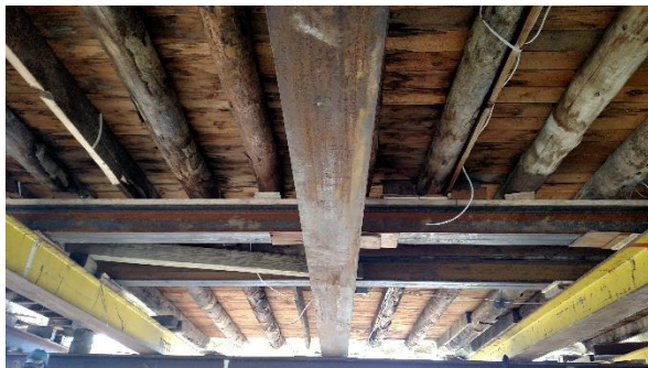
Old Timber Floor Joists Under Green's