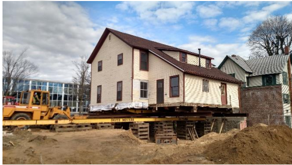
Green's Move In Progress