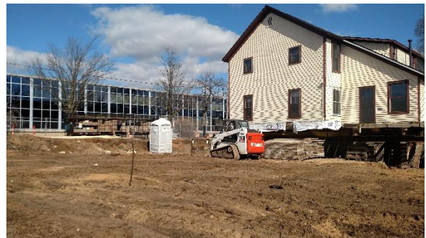
Green's Move Complete