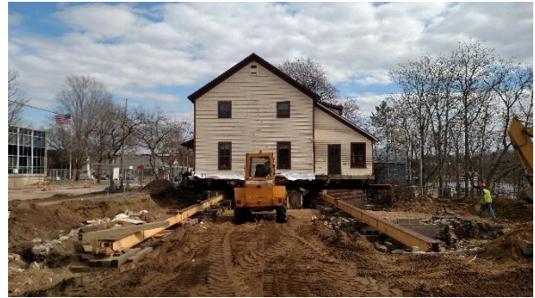
Green's Move In Progress