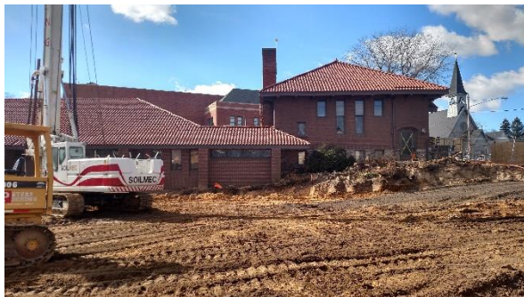
Site Graded to Start Shoring