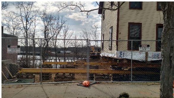
Green's Move In Progress