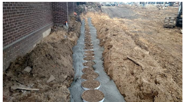
Template Poured for Drilling of Auger Cast Shoring