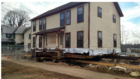
Green's Move In Progress