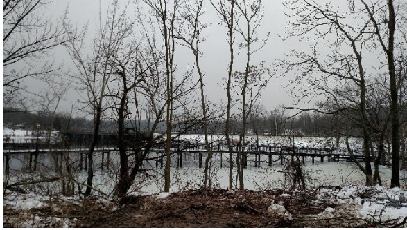
Tree Removal Along River