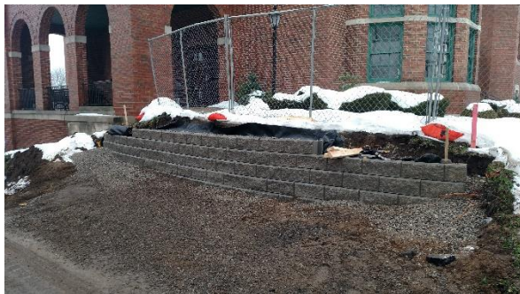
North Retaining Wall Along Griswold