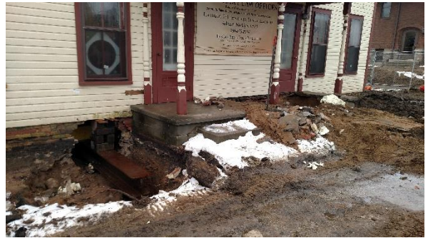
Shoring at Front of Green's House