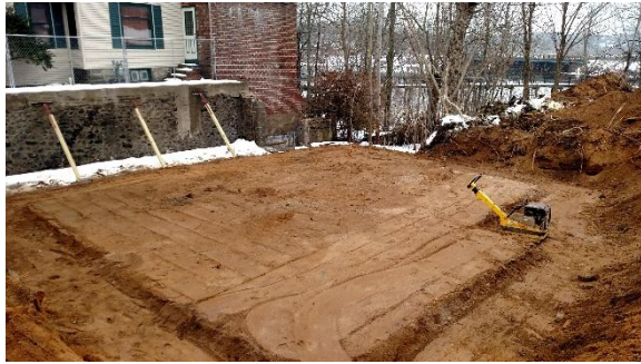
Excavation for Green's Foundation

Phase I (House Move & Library Addition) 6% Complete