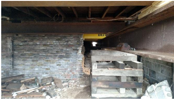
Shoring Under Green's House