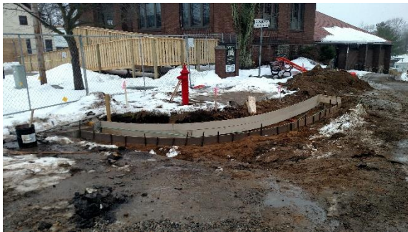
Concrete Curb at West Drive