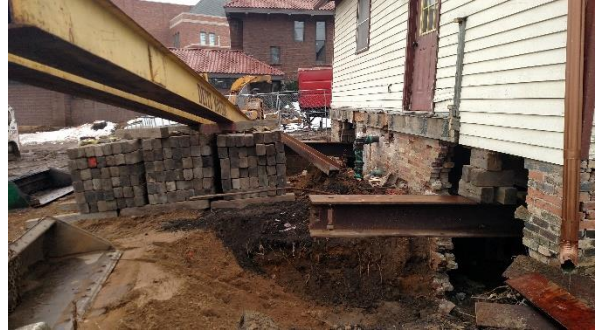
Shoring at Back of Green's House