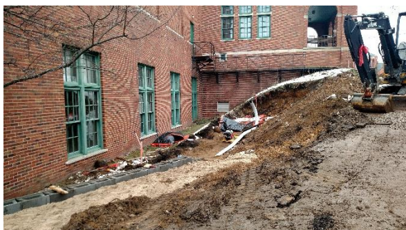
South Retaining Wall Along Griswold