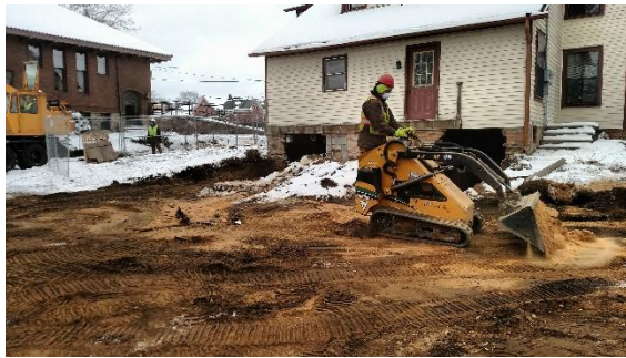
House Mover Removing Soil Below Crawlspace