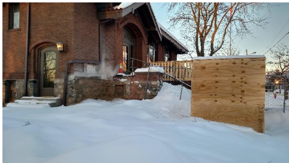
Existing Ramp Removed