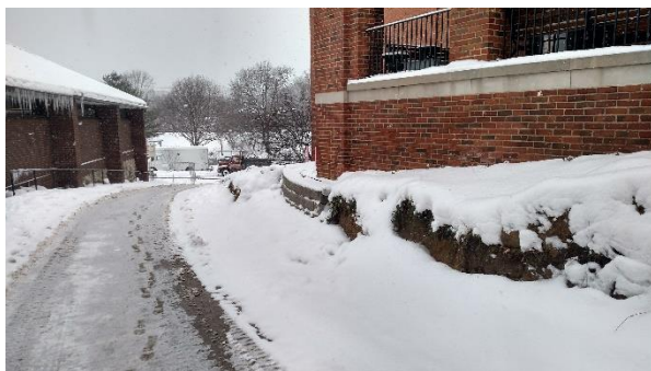
Retaining Wall at Griswold