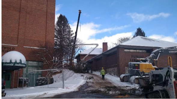
Tree Removal at West Drive

Phase I (House Move & Library Addition) 3% Complete