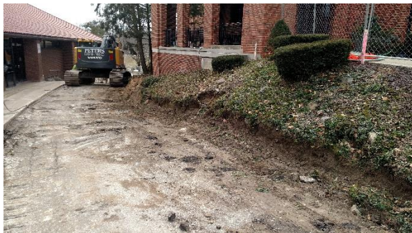
Grading for Retaining Walls