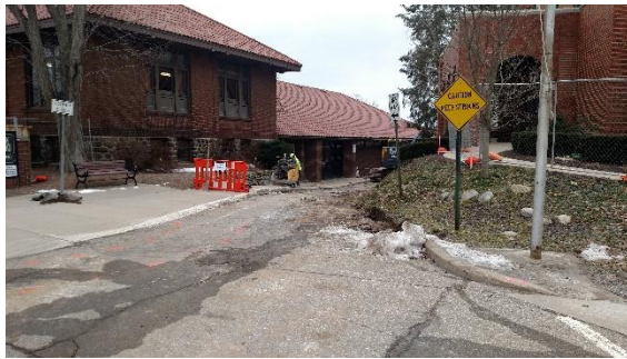
Saw Cutting of Sidewalk for Widened Drive