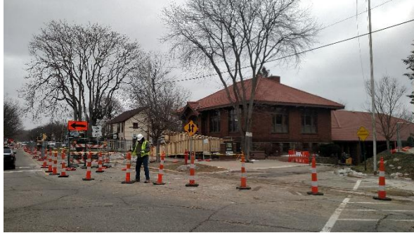
“Cone Zone” Traffic Control Installed