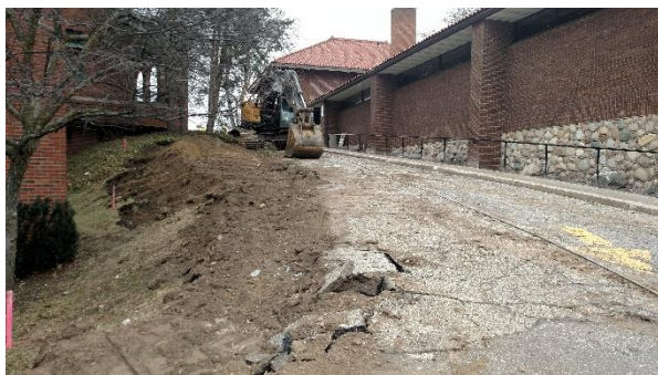
Excavation for Widened Entrance Drive