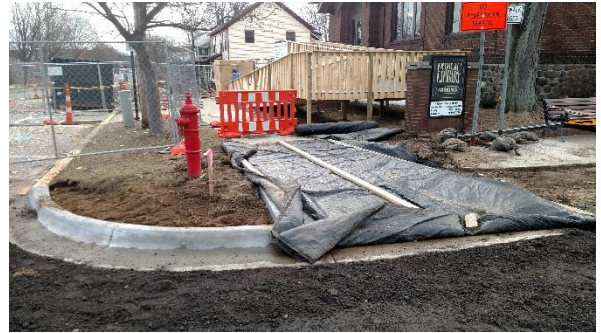
New Sidewalks Curing Under Blankets