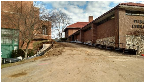
Drive Expansion Grading