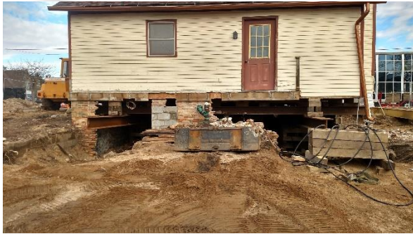
Shoring of Green's House