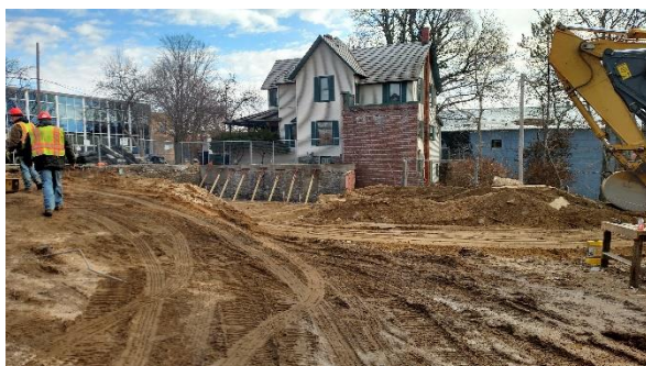
Site Excavation, Looking East