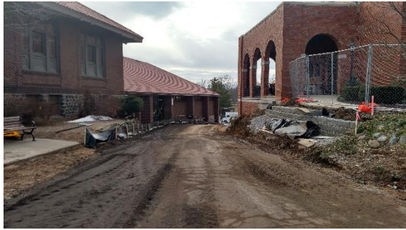
Drive Expansion Grading

Phase I (House Move & Library Addition) 9% Complete