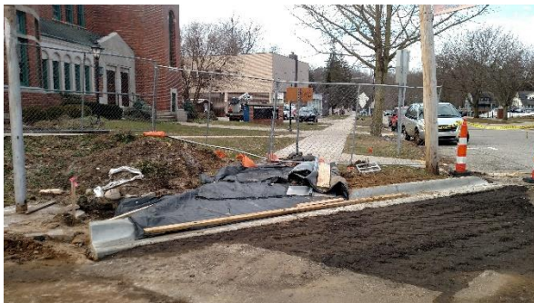
New Sidewalks Curing Under Blankets