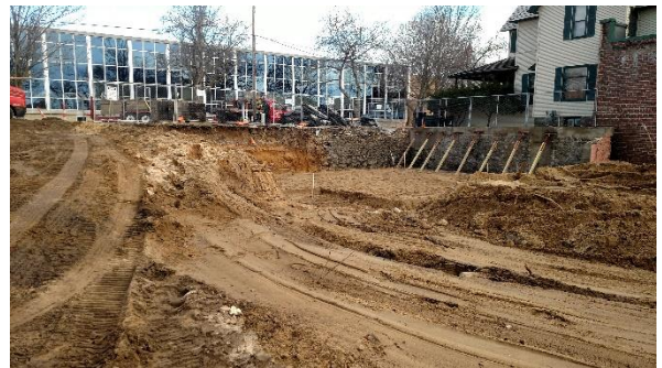
Site Excavation for Green's Foundation