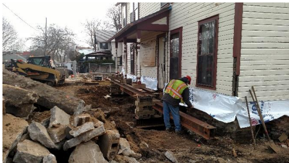
Shoring of Green's Porch